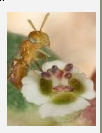
Perdita minima

When it comes to nesting, about 90 percent of these species are solitary, while the rest are social and hive-forming. Nests may be underground or above-ground in cavities depending on the species, nests may be constructed from mud (mason and plasterer bees), plants (leafcutter bees), earth (mining bees), or excavated wood (carpenter bees). Solitary bees tend to produce few young (often one to two) in underground nests, while some bumblebees and